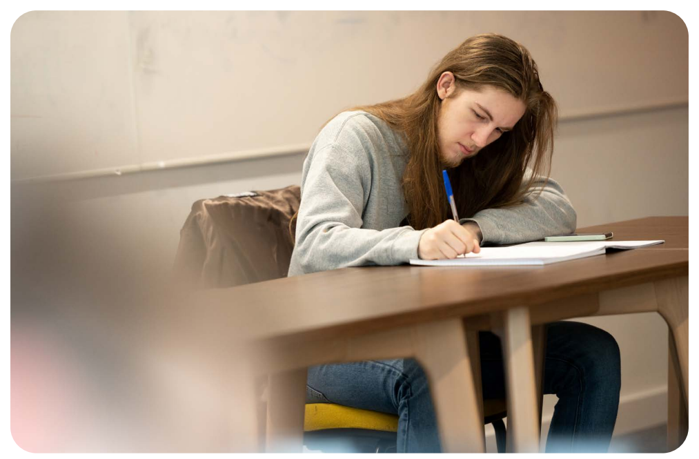
17 | Essential financial information 2023/24 Please see our webpages for the latest information and advice for students

The University of York has partnered with Flywire, to accept payments from international students worldwide. Easily and securely pay your fees in your own currency, using local payment methods. Simply login to your e:Vision account to pay your fees via Flywire.